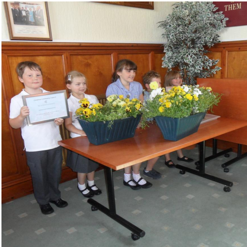
Proud winners of our Junior Schools in Bloom Competition 2014