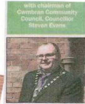
If you had to be stuck in lift with someone, who would it be and why?

My family who, through difficult and adverse times, no matter what, support and help you. I would like to be able to speak with my nan as she died in 2013, aged 93, and I was unable to be there and thank her for helping to shape the person I have become.