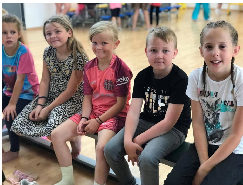
Nant Celyn Primary