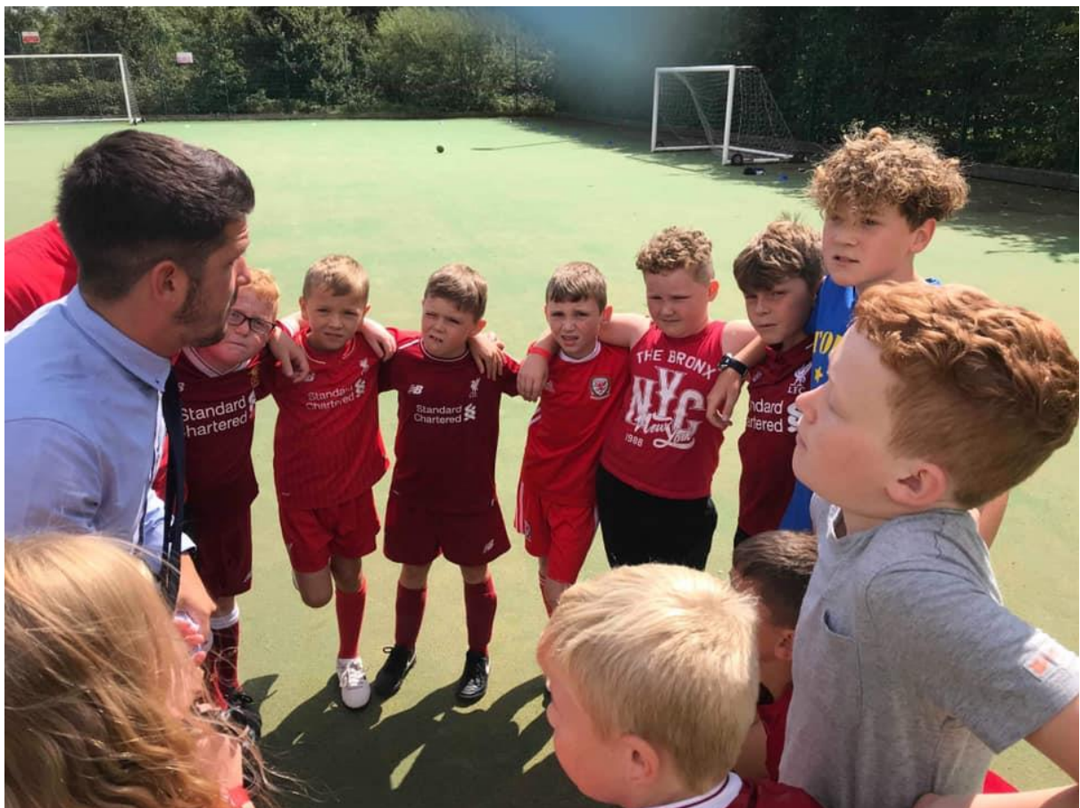
Coed Eva Primary