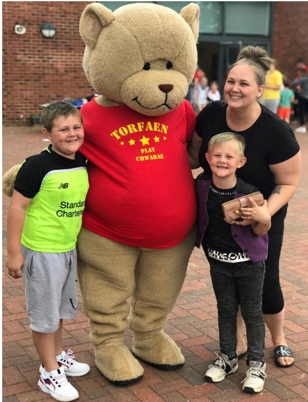
Blenheim Road Community Primary