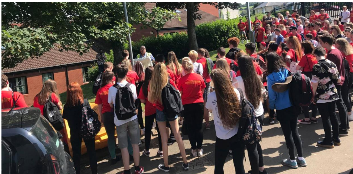
Fire Awareness Training